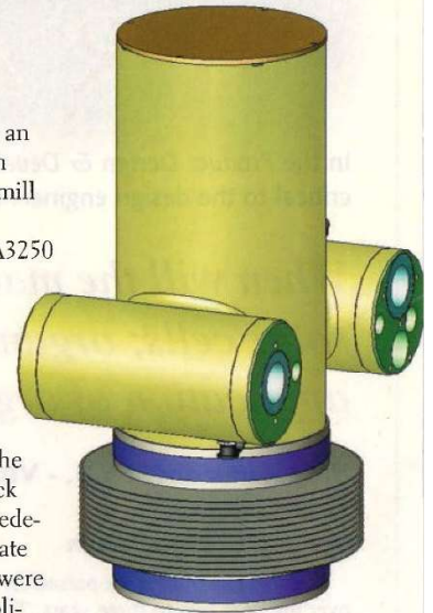
The complex LA3250 XZ-Axes housing consolidates many design features, resulting in a very clean product.

"We've had the LA3250 for about a year and a half now," Reilley says. "We're still waiting to be stumped by the application that will drive the next evolutionary step." PDD